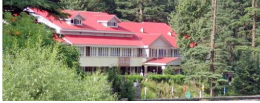
Overnight stay in Hotel.

Old Manali and Club House: The Club House in Manali is an amusement and adventure retreat set up on the banks of the Manalsu Nalla, a branch of the breathtaking Beas River. It is one place in the Manali Valley that has something for the entire family - whether it is indoor games/sports, entertainment or recreational activities In evening roam in Manali local Market including Tibetan monastery. Back to hotel