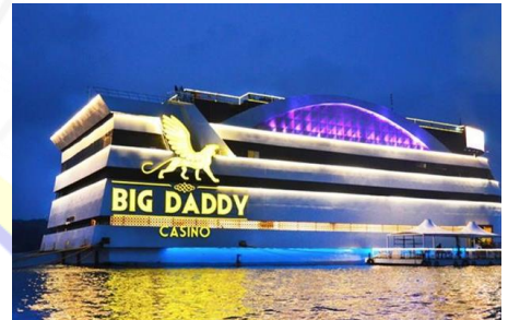
Big Daddy Casino