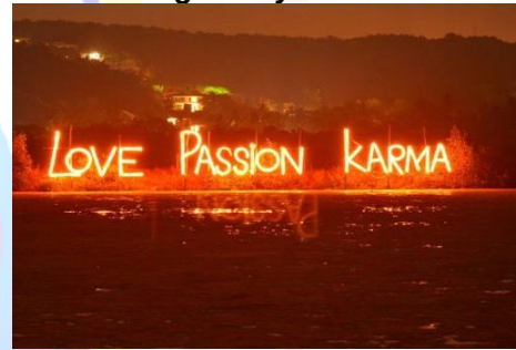
LPK (Love, Passion, Karma) Waterfront