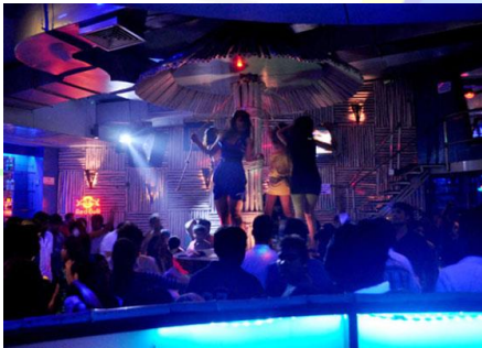
Tito's Bar and Club