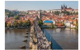
Prague Czech Republic